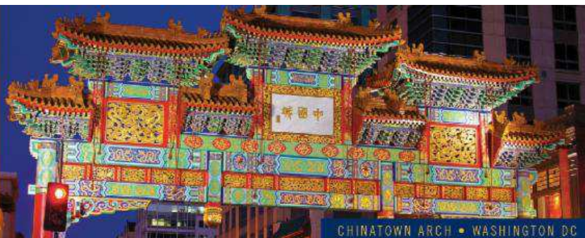
CHINATOWN ARCH • WASHINGTON DC